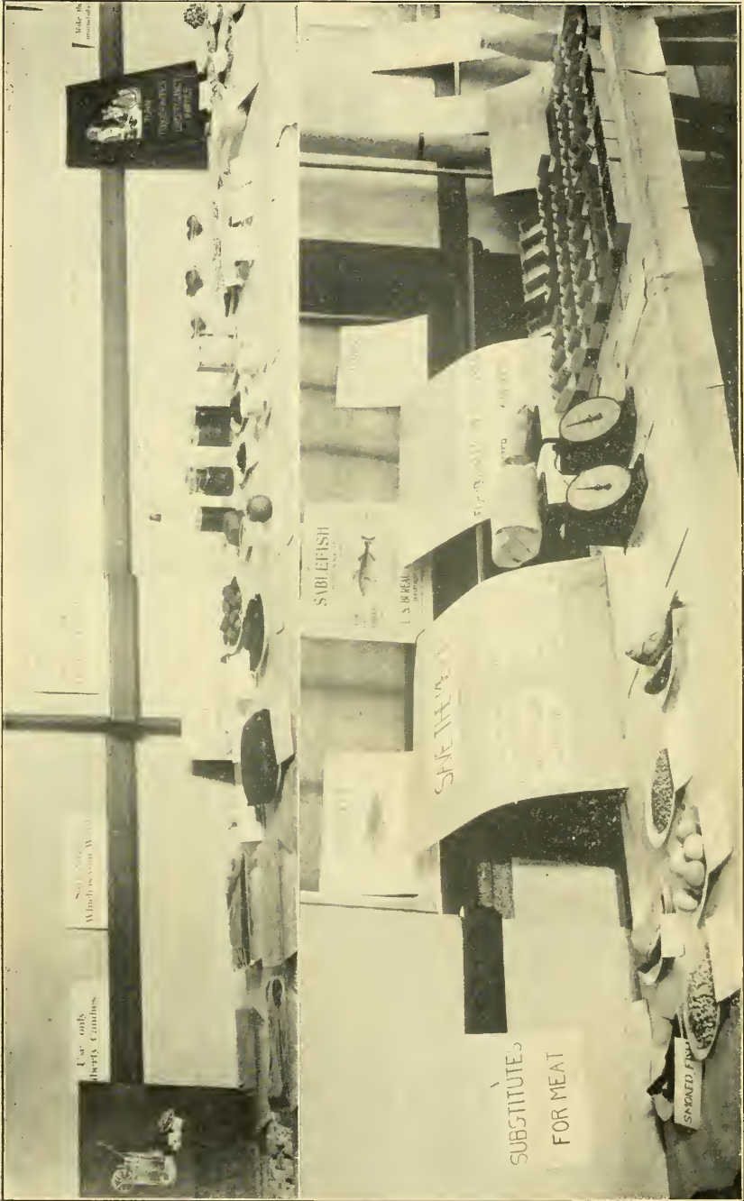
Liberty candles and sugarless sweets.