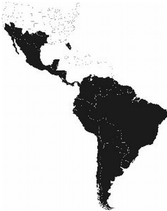
Figure 3. Distribution of Apis mellifera scutellata in the Americas as of 2007.

defensiveness. 'Beekeeping' (management of honey bee colonies by humans) is more common in Europe, where the native honey bees have been bred for gentleness and ease of management. In contrast, 'honey hunting' (near-complete destruction of hive to harvest contents) is more common in Africa, resulting in a bee that is more defensive of its nest. Other selection pressures that might have led to a heightened defensiveness in African bees include climatic stresses, resource availability, and predation by birds, mammals, and various reptiles. These selection pressures resulted in an African race of bee that can be many times more defensive than most of the various European races of bee.