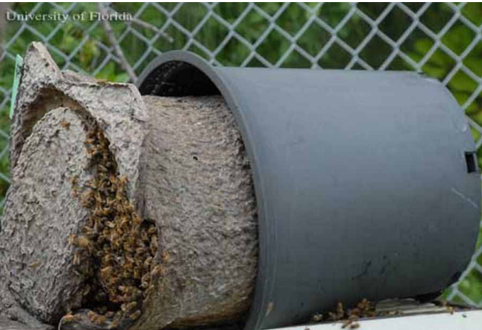
Figure 7. African honey bee, Apis mellifera scutellata Lepeletier, colony that has established itself in a swarm trap.

Due to their heightened defensive behavior, African honey bees can be a risk to humans. Children, the elderly, and handicapped individuals are at the highest risk of a deadly attack due to their inability or hampered ability to escape an attack. African honey bees are agitated by vibrations like those caused by power equipment, tractors, lawnmowers, etc. Further, their nesting habits often put them in close proximity to humans. Because of this, precautions should be taken in an area where Africanized honey bees have been established. These precautions are not suggested to make people fearful of honey bees but only to encourage caution and respect of honey bees. The precautions include remaining alert for honey bees flying into or out of an area (suggesting they are nesting nearby), staying away from a swarm or nest, and having wild colonies removed from places that humans frequent. The latter is perhaps the most important advice one can heed when dealing with African bees. In the USA, a large percentage of African bee attacks occur on people who know a nest is present but elect not to have it removed (or try to do it themselves).