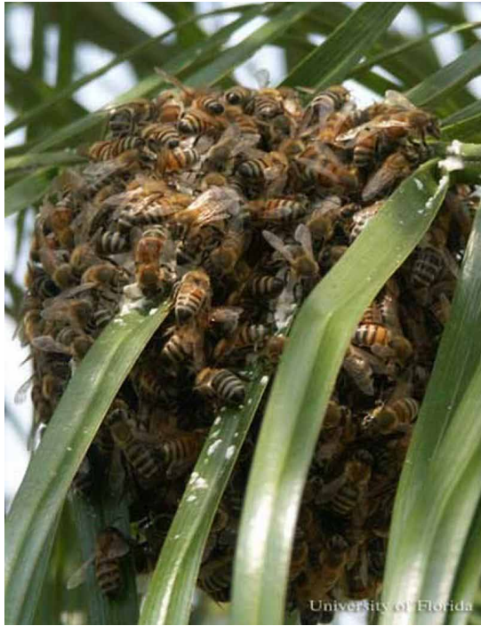
Figure 5. African honey bee, Apis mellifera scutellata Lepeletier, swarm on palm fronds.