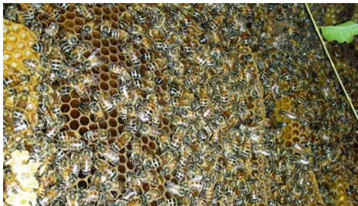
Figure 1. Adult African honey bees, Apis mellifera scutellata Lepeletier, on comb in colony.

The African honey bee, Apis mellifera scutellata Lepeletier, is a subspecies (or race) of the western honey bee, A. mellifera Linnaeus , that occurs naturally in sub-Saharan Africa but has been introduced into the Americas. More than 10 subspecies of western honey bees exist in Africa and all justifiably are called 'African' honey bees. However, the term "African (Africanized) honey bee" refers exclusively to A.m. scutellata in the bee's introduced range.