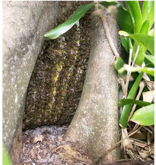
Figure 6. An African honey bee, Apis mellifera scutellata Lepeletier, colony between buttress roots of a tree.

leave the nest rather than remain in the hive. African bees use more propolis (a derivative of saps and resins collected from various trees/plants) than do European bees. Propolis is used to weather-proof the nest and has various antibiotic properties. African colonies produce proportionally more drones (male bees) than European bees. Their colonies grow faster and tend to be smaller than European colonies. Finally, they tend to store proportionately less food (honey) than European bees, likely a remnant of being native to an environment where food resources are available throughout the year.