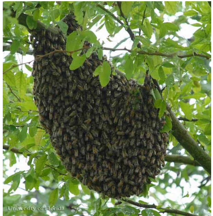
Figure 4. African honey bee, Apis mellifera scutellata Lepeletier, swarm in tree.

Another behavioral difference between African and European bees concerns colony level reproduction and nest abandonment. African honey bees swarm and abscond in greater frequencies than their European counterparts. Swarming, bee reproduction at the colony level, occurs when a single colony splits into two colonies, thus helping to ensuring survival of the species. European colonies commonly swarm one to three times per year. African colonies may swarm more than 10 times per year. African swarms tend to be smaller than European ones, but the swarming bees are docile in both races. Regardless, African colonies reproduce in greater numbers than European colonies, quickly saturating an area with African bees. Further, African bees abscond frequently (completely abandon the nest) during times of dearth or repeated nest disturbance, while this behavior is atypical in European bees.