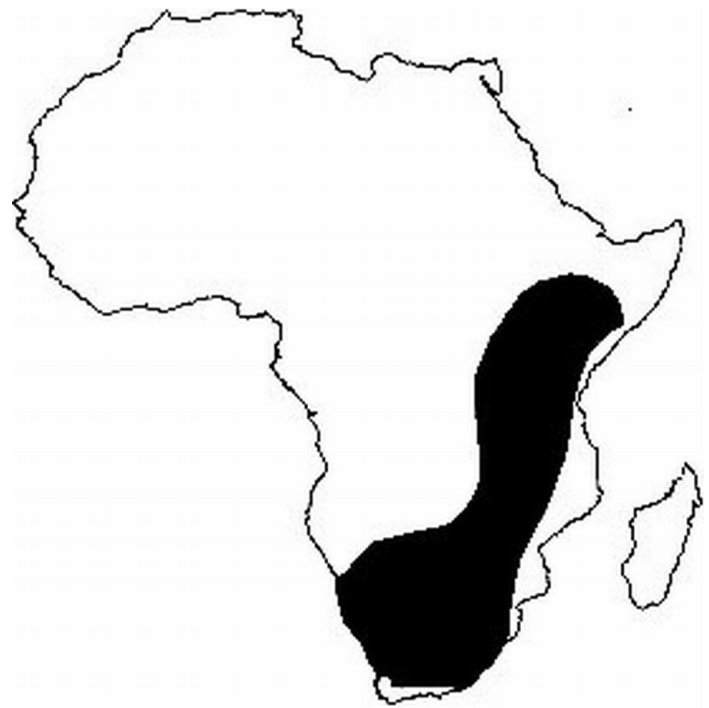
Figure 2a. Native distribution of Apis mellifera scutellata

African honey bees cannot be distinguished from European honey bees easily, although they are slightly smaller than the various European races. Laboratory personnel use morphometric analyses to determine the likelihood that a given colony is Africanized or fully African. With honey bees, the measurement of wing venation patterns and the size and coloration of various body parts (morphometry) are important determinants of identification at the sub-specific level. Morphometry has been used to differentiate honey bee races since the 1960s and remains the first round of identification when suspect colonies are discovered.